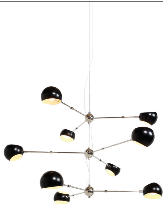
Shown above with three tiers