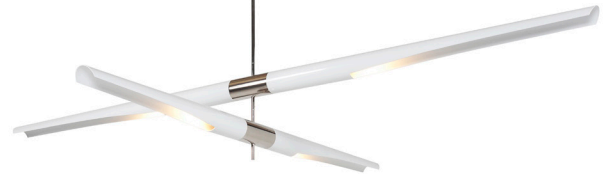
Shown above with 2 tiers